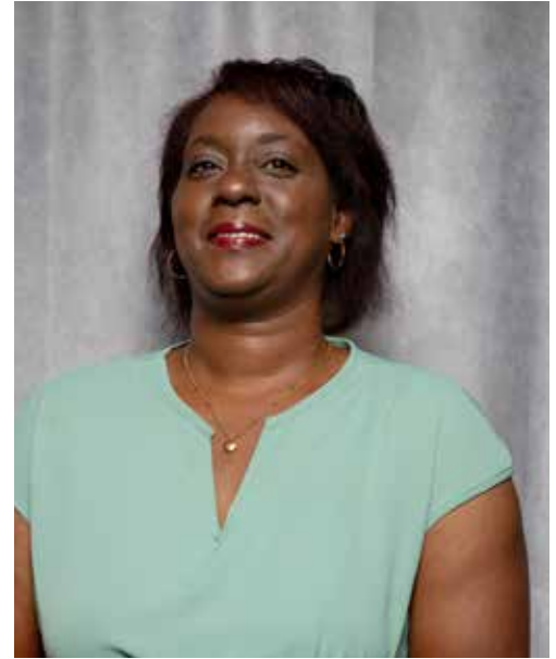
SUPPORT SERVICES MONA TAYLOR BUILDING 79, A-SHIFT